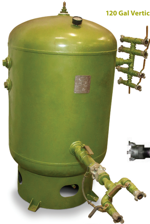
120 Gal Vertical Receiving Tank