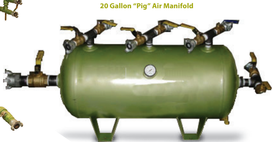
20 Gallon "Pig" Air Manifold