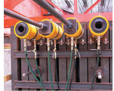
Double-Acting Hollow Plunger