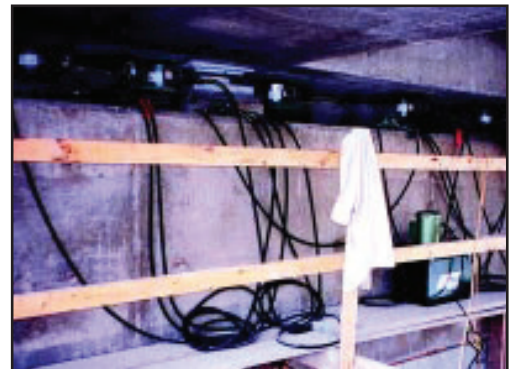
Simplex RLS Series provides the ideal fit & force required for most bridge lifting and pier cap maintenance jobs. Compact, light weight & tough as nails, Simplex cylinders are at home on any construction site.