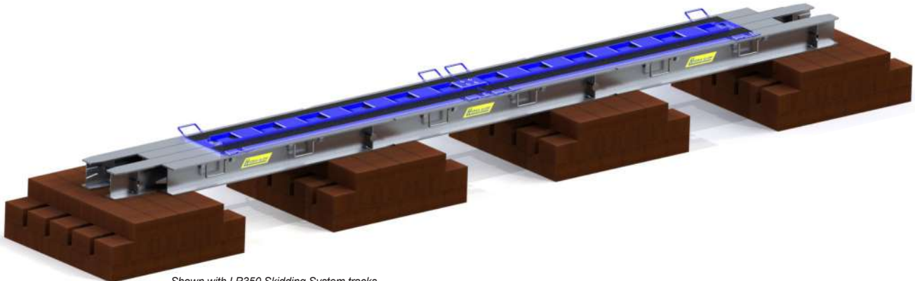
Shown with LP350 Skidding System tracks